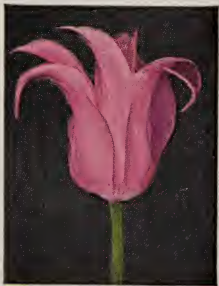
LILY TULIP SIRENE